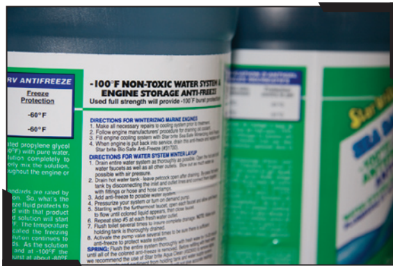
Use non-toxic or less toxic antifreeze.