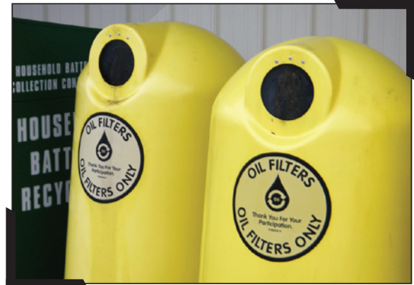
Oil Filter Recycling Containers.

The general maintenance of boats can generate pollutants and waste products (i.e., hazardous waste) that can be harmful to the environment. Some of these potential pollutants include solvents, paints, lubricants, oil, anti-freeze, fuel, batteries, and bilge switches that contain mercury. Proper use, storage, and disposal are key to keeping these pollutants out of the environment. You, as a boater on Indiana water, can be an active steward of this valuable resource by implementing these practices: