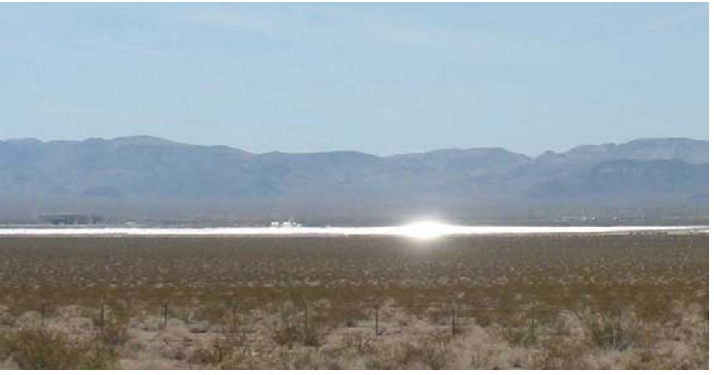
The Problem Big Solar: Big Footprint

Loss of wind causes Texas power grid emergency February 7, 2008