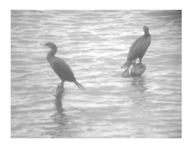
Double Crested Cormorants perched on a submerged tree at the Falls of the Ohio