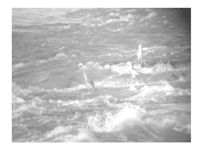
Great Blue Herons search for fish in The rapids at the Falls of the Ohio