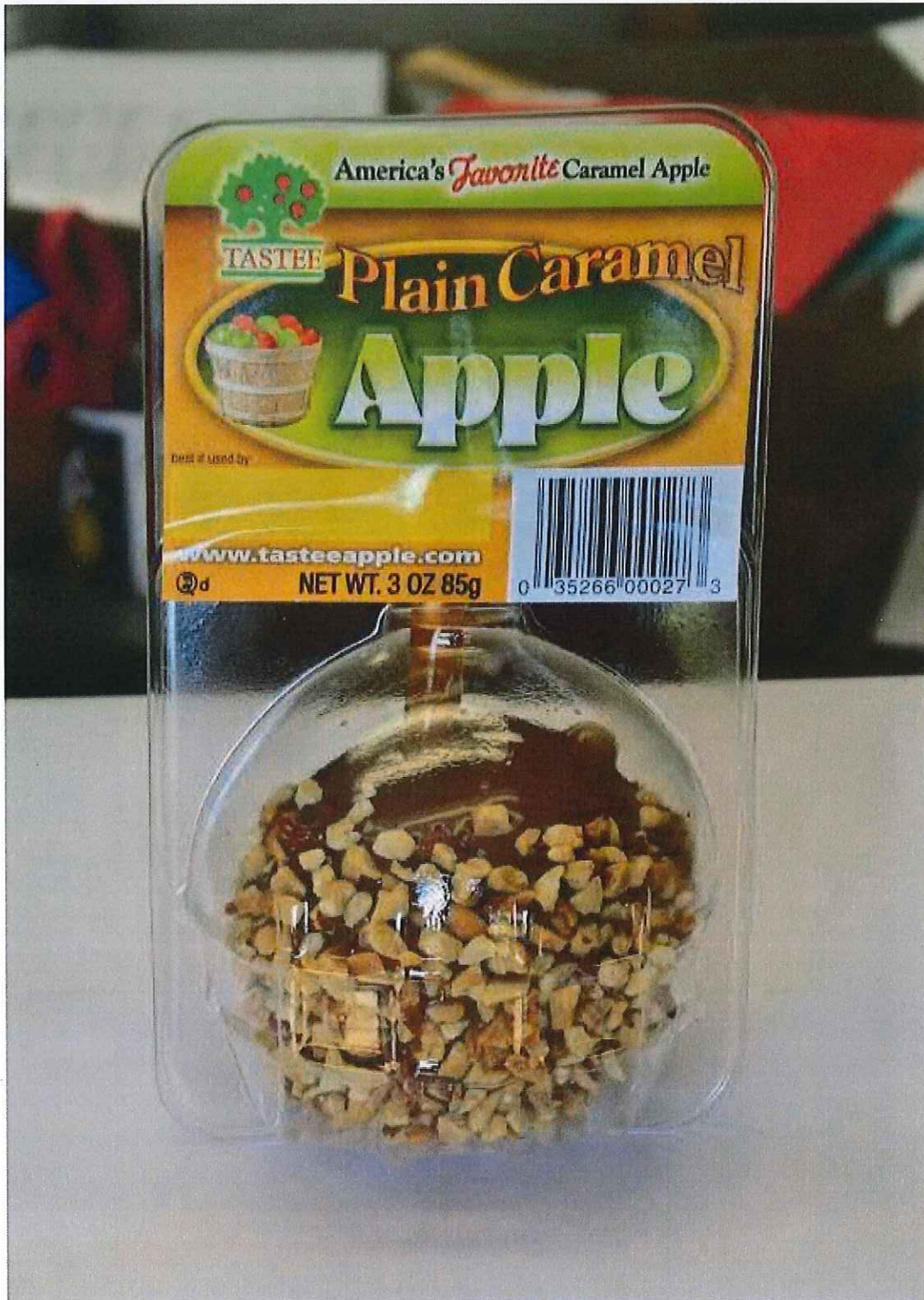
Tastee Apple, Inc., Issues Allergy Alert On Undeclared Peanuts In Plain Caramel Apples Photo