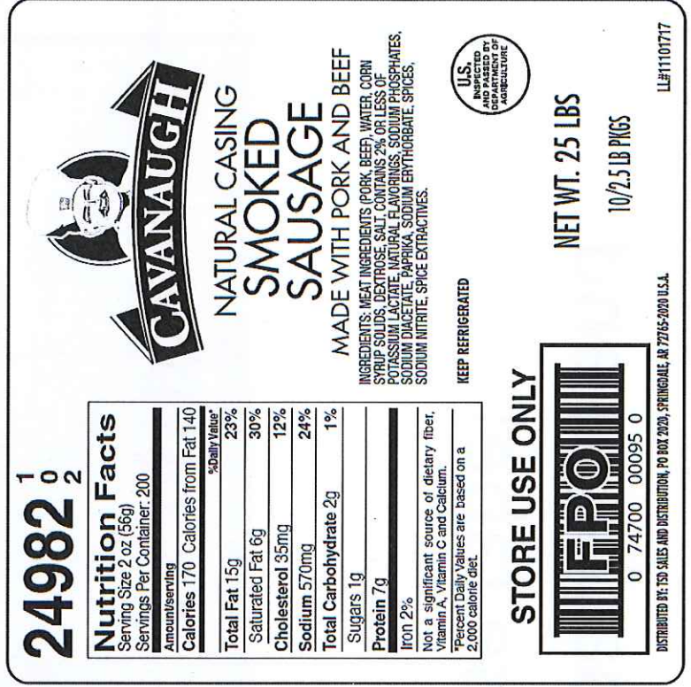
Master Case Label