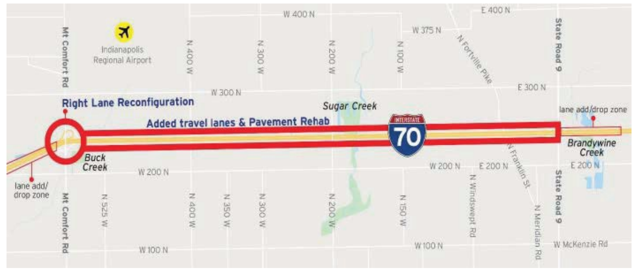
FIGURE 1-2. PROJECT MAP DETAIL

The Categorical Exclusion-4 was approved in May 2021.