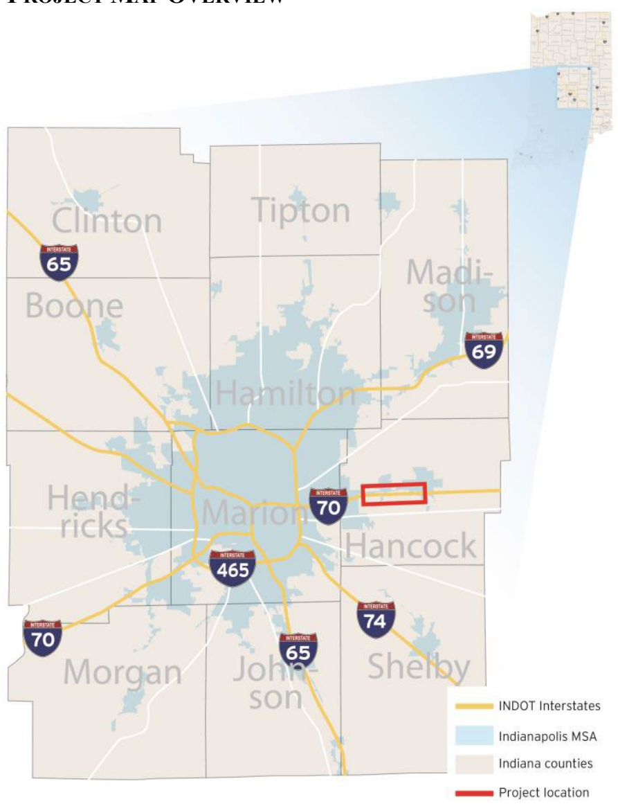
FIGURE 1-1. PROJECT MAP OVERVIEW

From an environmental standpoint this project strictly follows the NEPA documentation process and guidelines. A NEPA Final decision has been achieved as of the preparation of this FPAU.